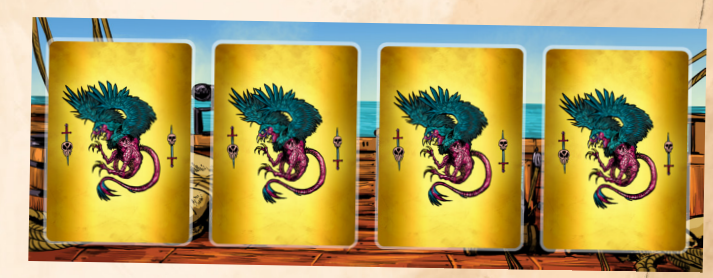
Ship board with orders placed faced down on all four positions.

Your ship's Orders are then revealed and resolved one at a time, in sequence from left to right, starting with position 1 and finishing with position 4.