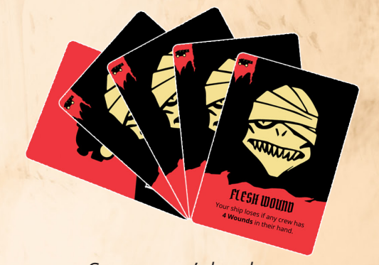
Gunner crew's hand with four wounds.