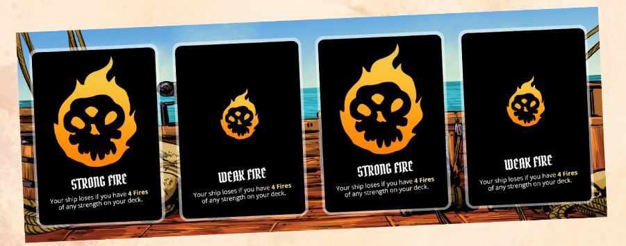
Ship Board with fires in all four positions.

To claim victory, your team's ship must sink the enemy's ship by igniting all 4 of its board positions with fires or by filling any one of its crews' hands with 4 wounds.