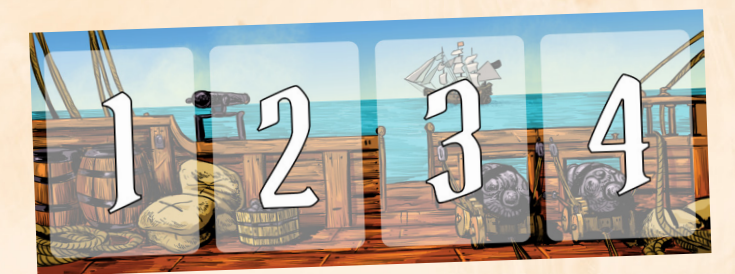
Empty Ship board.

Using the Active Orders in your crews' hands, you will work as a team to program a strategy for your ship at the beginning of each round. The Captain of your ship then executes that strategy by placing up to one Order from each crew face down onto one of the four positions on the ship's board.