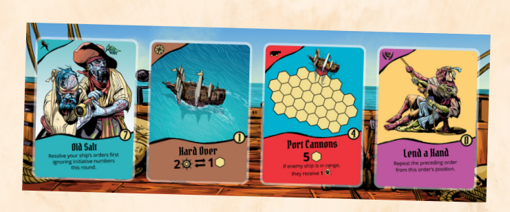
Ship board with four Orders cards revealed.

Your ship's Orders are then revealed and resolved one at a time, in sequence from left to right, starting with position 1 and finishing with position 4.